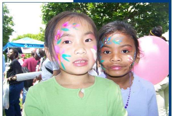
Good in the Neighborhood fair

PDC continues to work with and respond to its regional partners, including the Association of Regional Economic Development Partners and Greenlight Greater Portland. Currently, PDC is updating specific economic development strategies related to retail, target industries and regional economic development.