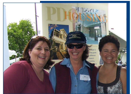
PDC staff answer questions about programs and opportunities PDC-sponsored outreach events.

PDC will continue to learn from and build on its recent organizational accomplishments which include the establishment of a Diversity Council, an internal communications survey, and classification, compensation and benefits reviews.