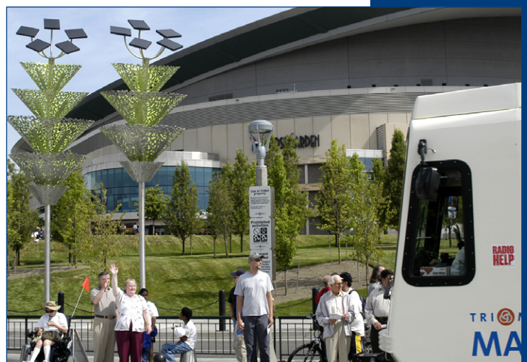
MAX Yellow Line opening day

Projects such as the Portland Streetcar and light rail expansion, and PDC’s annual budget development provide opportunities for the PDC Board and City Council to build upon its productive partnership and align our objectives.