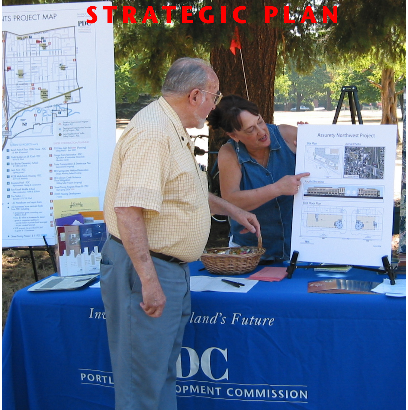
Public Outreach at the 2007 Lents Founders Day