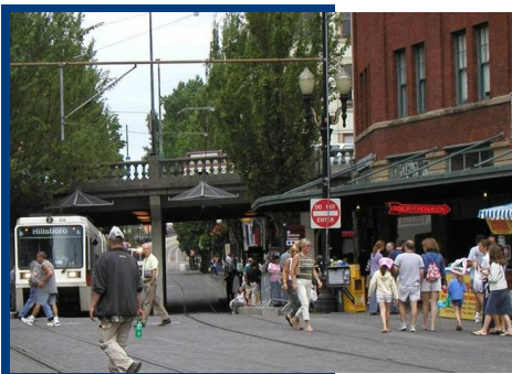
Major changes are in store for Saturday Market.

PDC will increasingly consider, estimate and track the revenues that result from its investments.