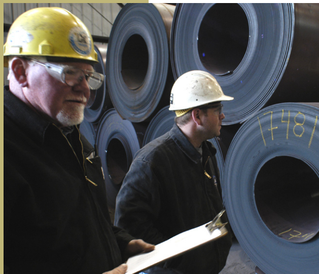
PDC's Target Industries program offers marketing and technical support to area industries