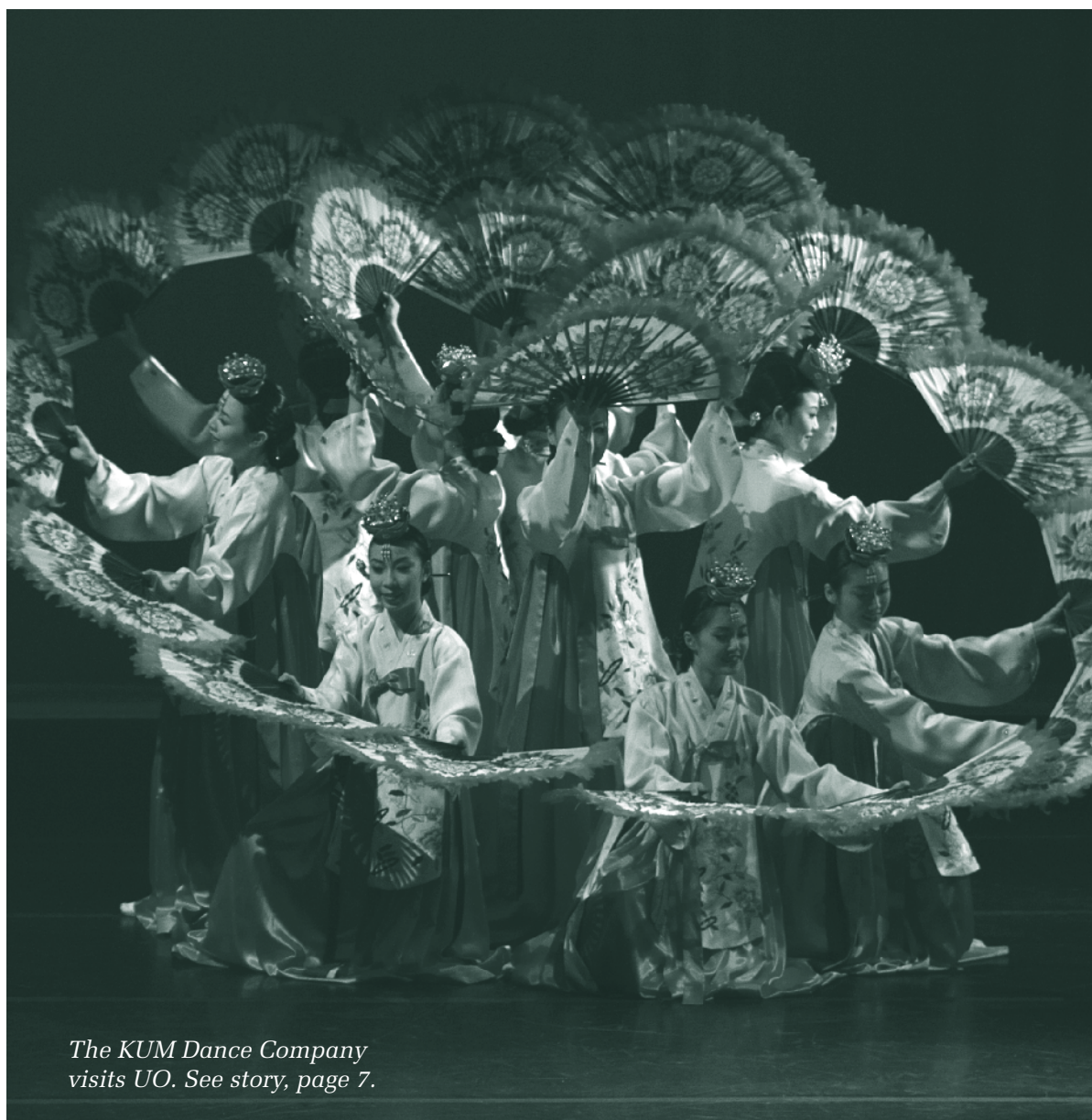
The KUM Dance Company visits UO. See story, page 7.