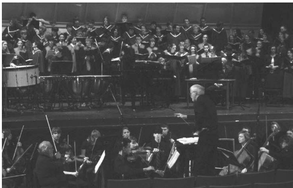
Wayne Bennett conducts a special production of Carmina Burana in Medford, featuring students from both North and South Medford high Schools.