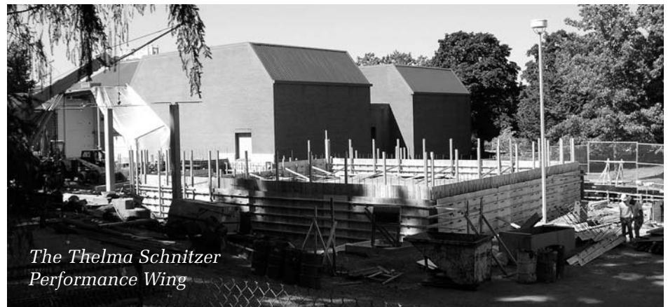
The Thelma Schnitzer Performance Wing

Construction began in the spring on the new wings to the music building. For additional construction photos, go to our website at music.uoregon.edu ; click on “Construction Information” on the left side of the page.