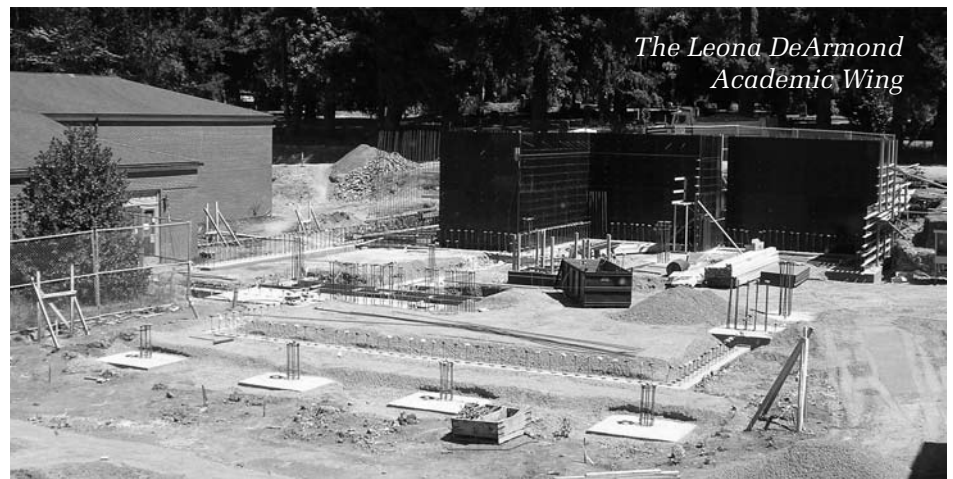
The Leona DeArmond Academic Wing