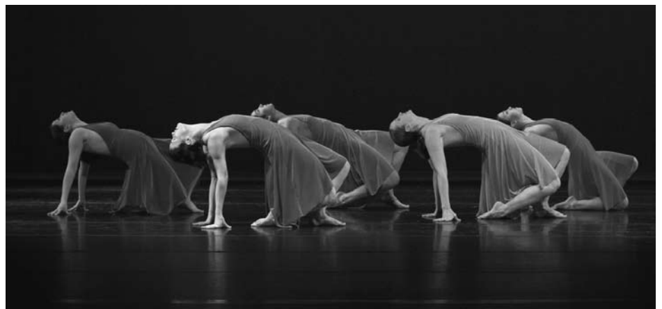
The UO Repertory Dance Company in its 2007 spring tour.