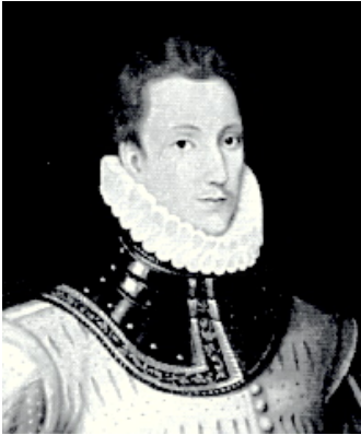
National Portrait Gallery