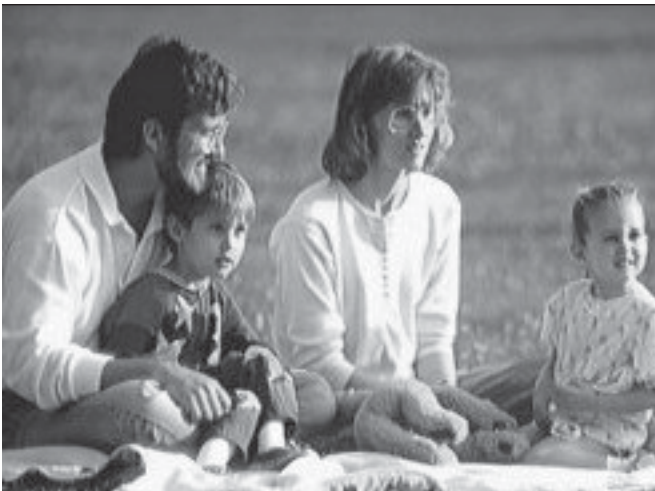
165 Families and children on the waiting list for emergency transitional shelter.