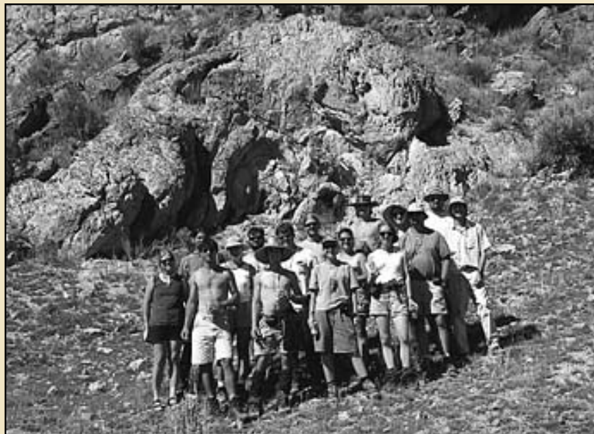
Geology students near deformed rocks.

The 1999 earthquake disasters in Turkey and western Columbia no doubt led many people to wonder how such a quake would impact the Northwest. For University of Oregon geology faculty and students, the quest to understand such natural phenomena leads them to spend countless hours gathering as much information and data about the earth as possible. Combining field investigations with laboratory experiments and theoretical studies is essential. For students majoring in geology, the UO Geological Sciences Field Camp provides the field training and background needed for geology, mining, petroleum, and environmental and engineering careers.