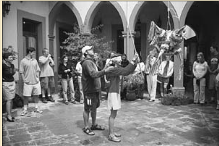
UO student throws a pinata bash at the Interamerican University Studies Institute in Queretaro, Mexico.