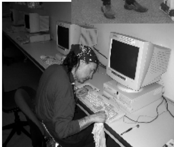
LIBRARY STAFF MEMBERS CLEANED, POLISHED, AND PAINTED AT THE FIRST ANNUAL LIBRARY DAY.