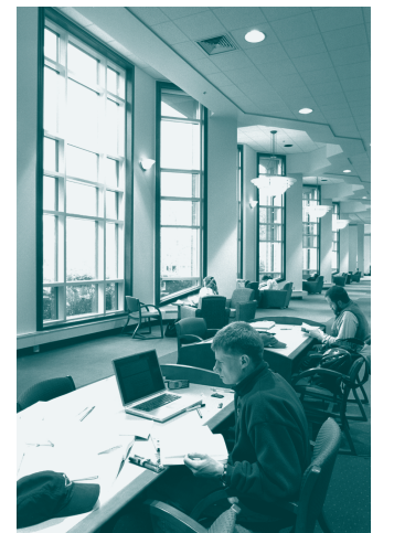
Students in the South Reading Room of Knight Library enjoy the beautiful new study tables and grouped upholstered chairs. The new furnishings were made possible by generous donors.