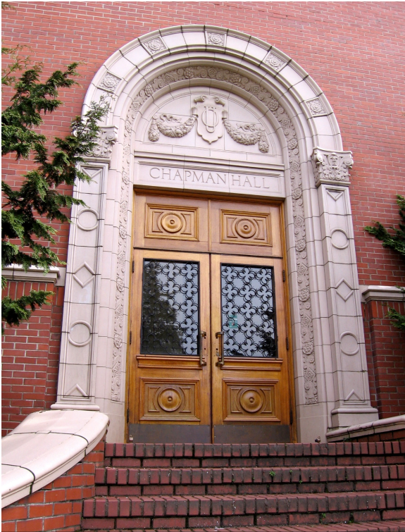
Figure 2. Chapman Hall, main entry detail.