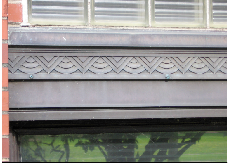
Figure 1. and 3. Chapman Hall, decorative details.