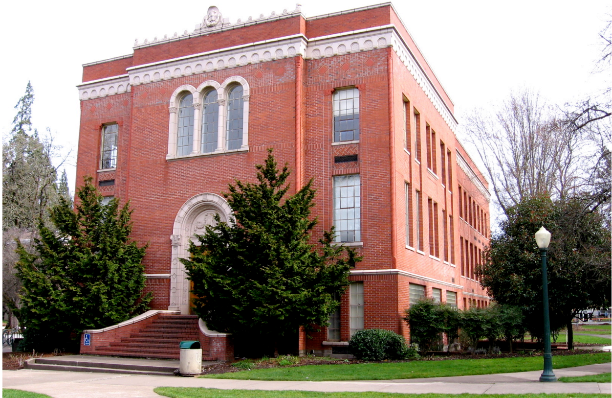
(See Continuation Sheet 1 for additional photos)