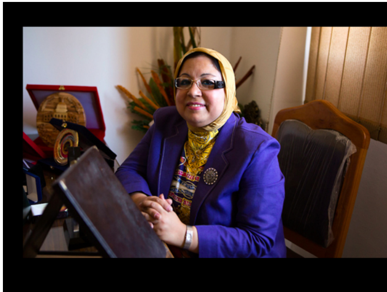
( https://adanewmedia.org/wp-content/uploads/2018/10/fig.1-dinashokry.jpg )