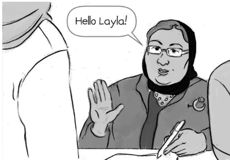
( https://adanewmedia.org/wp-content/uploads/2018/10/fig.2-shokryillustration.jpg )