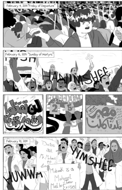
* Graffiti (panel 3) by unknown artist. The graffiti reads, "You will not kill our revolution."

( https://adanewmedia.org/wp-content/uploads/2018/11/Page-7.png )