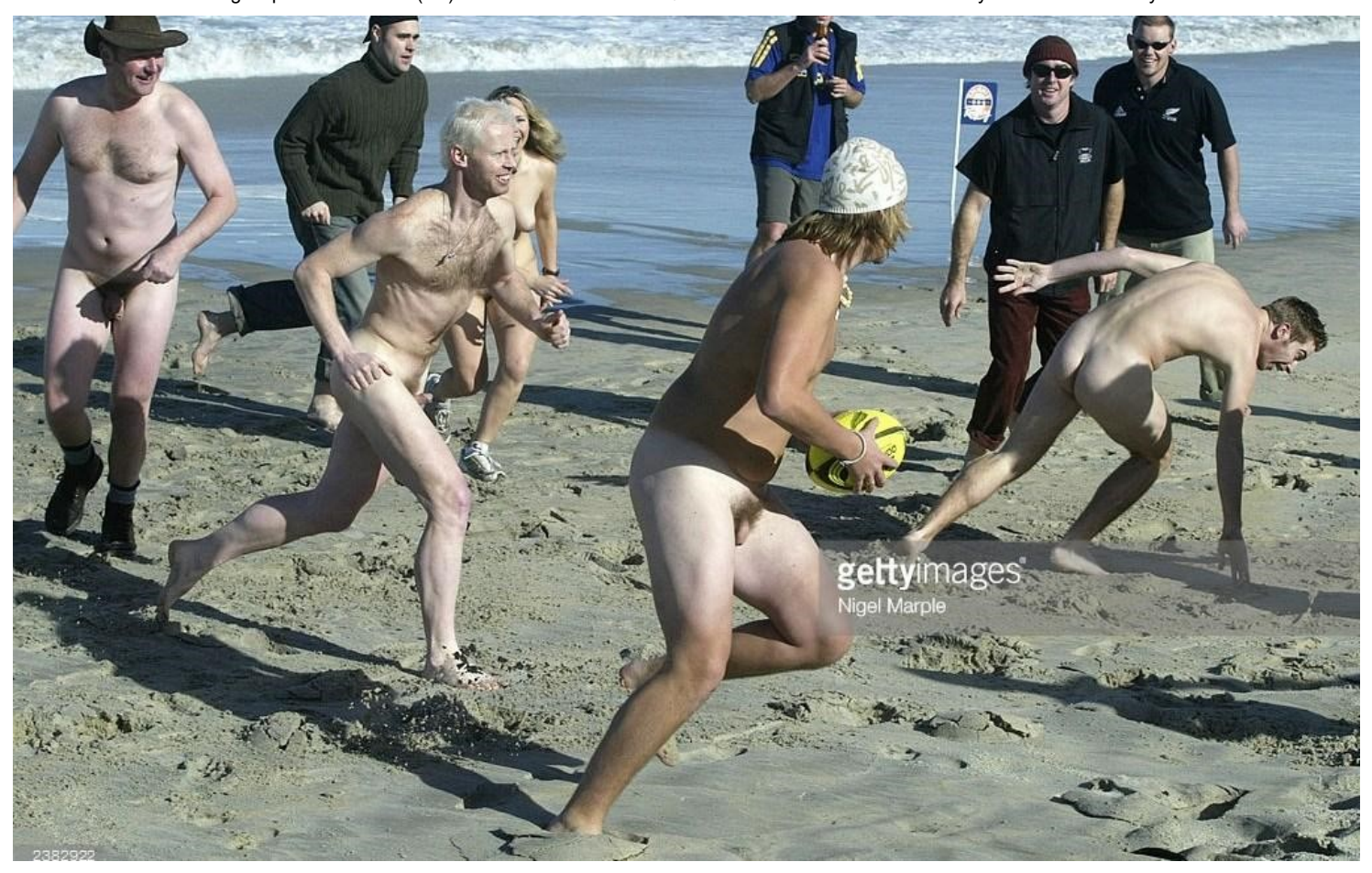
Figure 3. "Rugby Fetish and Gay Men" photo illustration of nude men (and one nude woman) playing rugby on a beach near clothed spectators.

In this post the vocabulary choices construct particular ideological representations of events (Willems 2004). The terms "spunk" and "vim" are aligned with the "virility" and "force" associated with normative masculinity. The frame of "trainee" places the gay man as an inferior in a social hierarchy. Economic and institutional power is being used here to construct desirability and undesirability. Also, the more athletic a man is, the more masculine appeal he has and the more desirable he is for sex without any other reasons. As a result, the athletic rugby player who is represented as the epitome of desirable sexuality is likely to lead another gay man into "going down on him." Finally, after making this position clear, the writer states that all this "is partly to do with the desire for masculinity." This demonstrates the valorization of masculinity within these representations, as there are no feminine-presenting gay men.