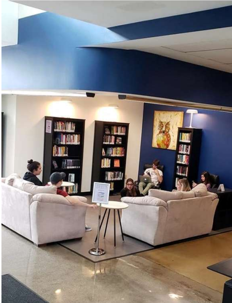
Students enjoying the new Diversity Burrow in the Wimberly Library

That area has no been repurposed to provide an inviting space for students to gather, to study alone, to read, to hang out. The Libraries staff took great pleasure in designing the space and donating furniture and artwork, as well as buying books and furnishings specially chosen for the spot. As we are able, we will continue to repurpose and redesign spaces to provide more seating, better functionality, and greater comfort.