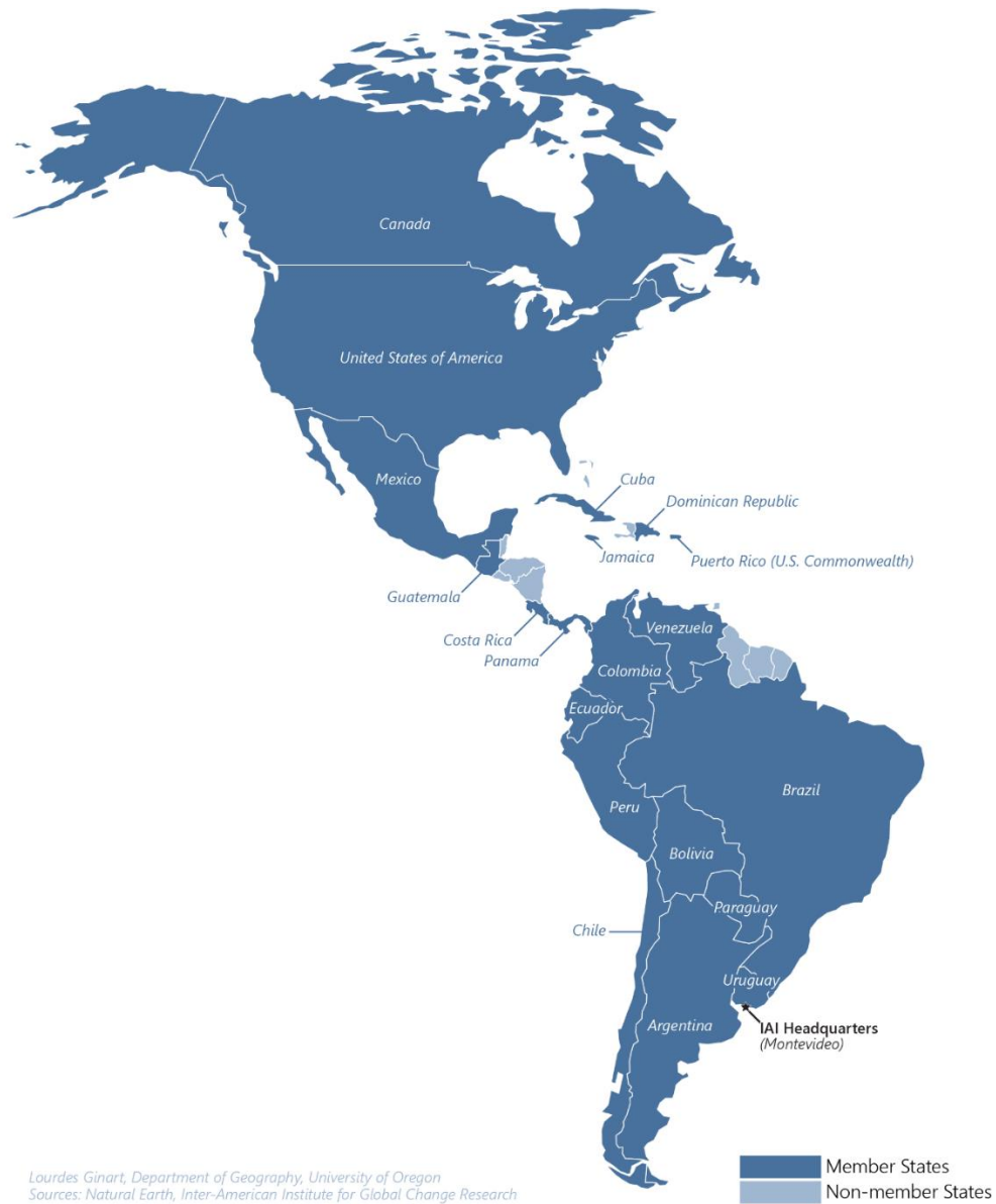
Figure 1: Map of member states to the IAI

both natural in origin and human-induced.” In my research, global change is rendered synonymous with climate change; that is, I am using climate change to stand for what the IAI calls global change.