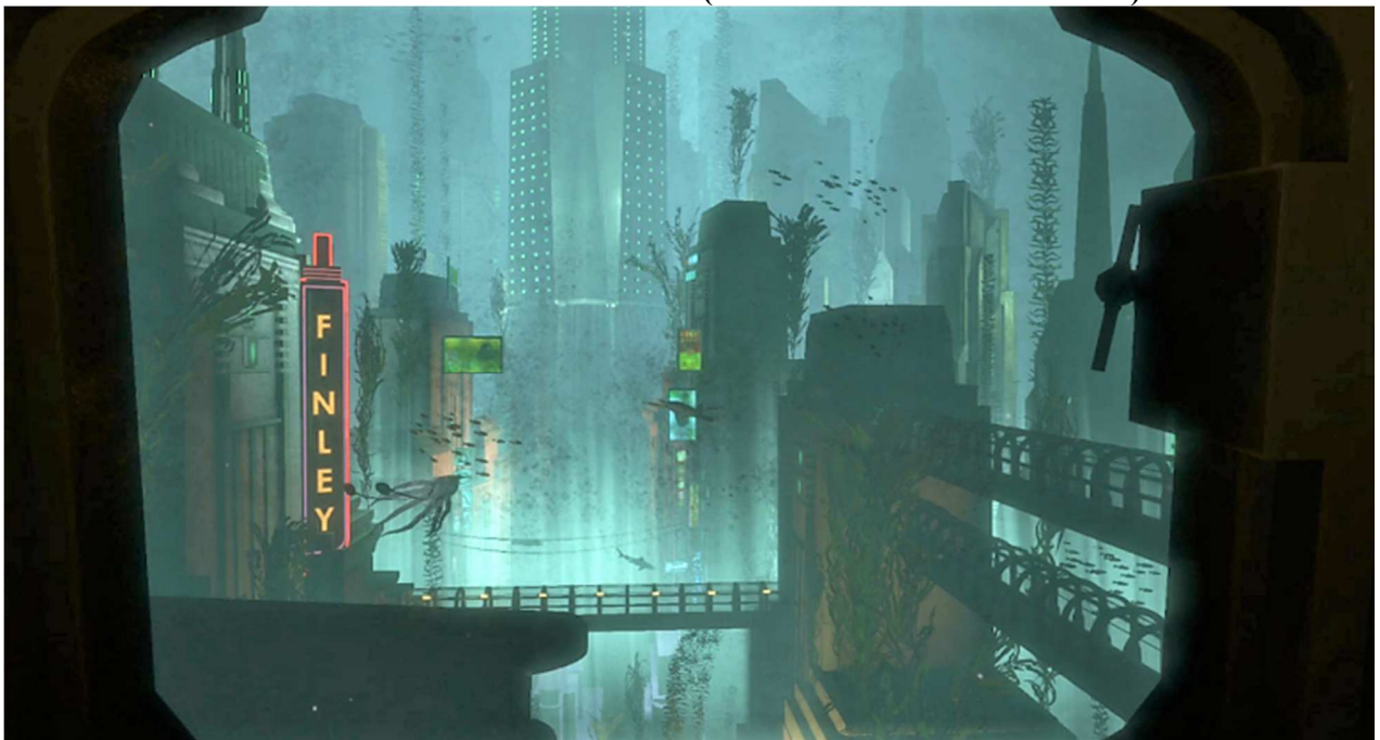
FIGURE 4: FIRST LOOK AT RAPTURE

“I chose the impossible; I chose Rapture!”: The player sees Rapture for the first time while listening to a recording by Andrew Ryan