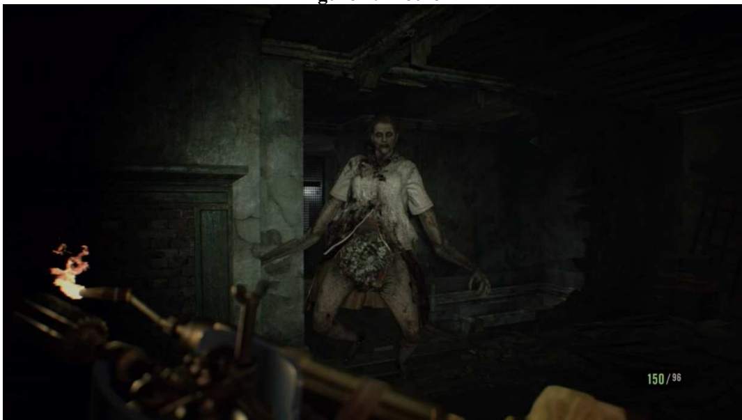
"I'm coming to get you!"

The first case study, centered on the twin worlds of Silent Hill , asked the reader to confront the possibility of sound as abject. Rooted heavily in Julia Kristeva's theory on the subject from her landmark Powers of Horror , the chapter defined abjection as the object of idea that participates in the act of perversion, of breaking down barriers between social decorum and expectations and existing purposely "outside" socially constructed