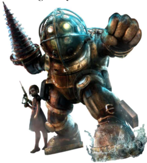
Crop and Clean by player Lego Slayer