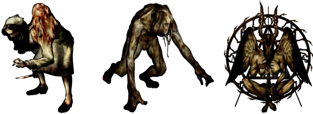
In order from left to right: Hospital Nurse, Romper, Incubus demon