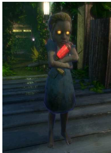
Screenshot from Bioshock.wikia.com