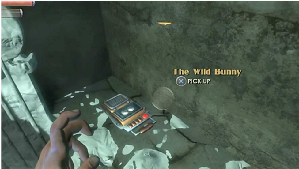
FIGURE 5: THE “ACCU-VOX”

happy with the original character, and I thought I’d really done something great, and then you show it to people [in a playtest], and they just hated it. And they didn’t trust him. If they didn’t trust him then we were screwed.” 64 It was clear to the game’s designers that voice acting was that crucial element that would dictate how both the huge reveal and the game’s meta-narrative would be received, hinging completely on the ability to deceive the player based solely on the quality of the character’s voice. As Chion writes, “[T]he presence of a human voice structures the sonic space that contains it.” 65 Voice dictates the direction of any scene, narrative, or location in which it is heard, and is often