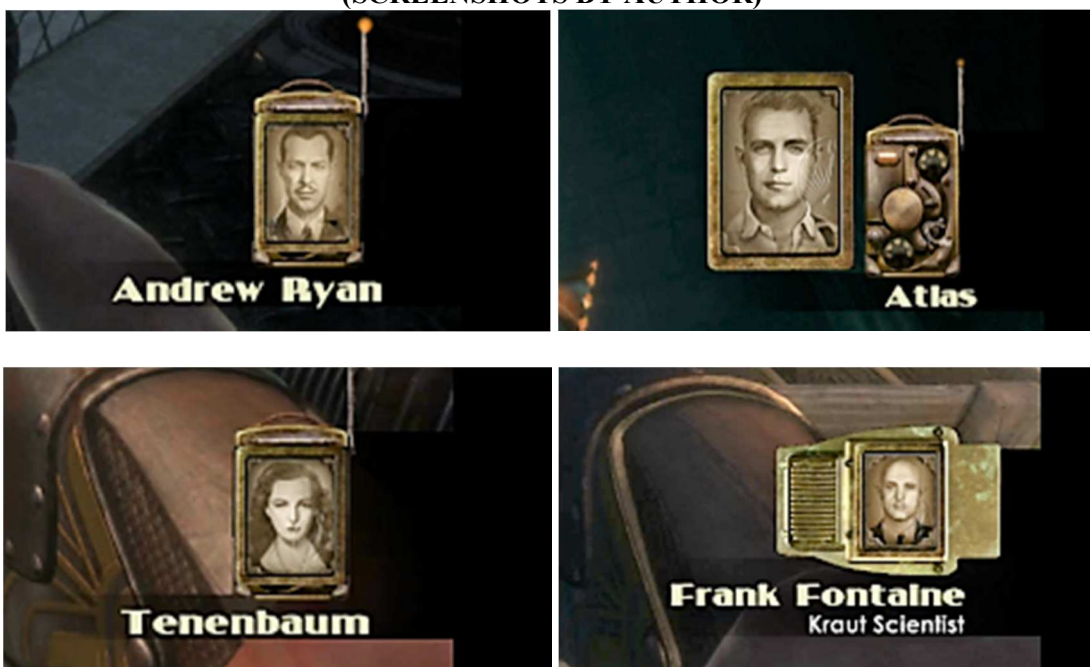
FIGURE 6: ANDREW RYAN, ATLAS, TENENBAUM, FRANK FONTAINE (SCREENSHOTS BY AUTHOR)

Rapture's voices are a crucial element of the Bioshock story. Without their sonic presence, Rapture lies a little flatter, a little less believable. These voices make Rapture, and its terror, a not-so-distant reality, giving a human credence to the game. However, as we will see in the next section, the music of Bioshock , both diegetic and non-diegetic, contribute to this feeling of possible reality in ways that simultaneously chill and enthrall. (Figure 6)