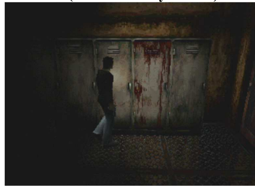
Otherworld version of Midwich Elementary

The mechanics of the game aid in the debilitation of player agency as well. Much in the style of other contemporaneous survival-horror titles, Silent Hill 's camera angles make movement awkward and its controls are difficult to navigate. The game also misleads the player into believing that what he is seeing is real; for example, the game opens with the player being forced to prompt Harry to chase his daughter through the pervasive fog, only to be cut down by swarms of deformed babies with butcher knives.