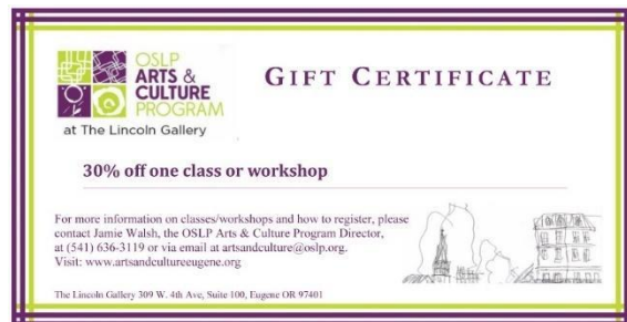
Figure 2: Focus group voucher

interviews. The voucher offered as an incentive for participating in the community member focus group as mentioned in the recruitment letter is shown in figure 2, below. Vouchers were handed out to those who took part in the community focus groups.