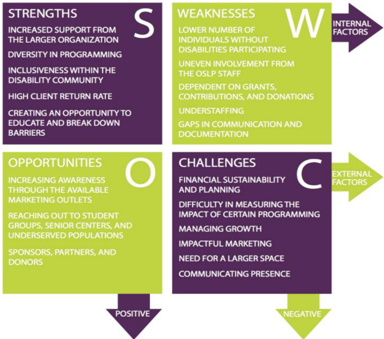
Figure 5: OSLP Arts & Culture SWOC Analysis (Bothwell, Payne, Vargas Ramirez, & Wyer, 2016).

identity? As mentioned in the administrative focus group, the program is entering an identity crisis. There is an increased need to shift how they are reaching out to community members and new participants through marketing. In the most recent professional project, the team created a SWOC analysis (figure 5). The analysis noted some of the challenges currently facing Arts & Culture. Of special importance are the issues of impactful marketing, as well as communicating community presence and programming.