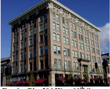
Empire Blg. 204 West 10th St.