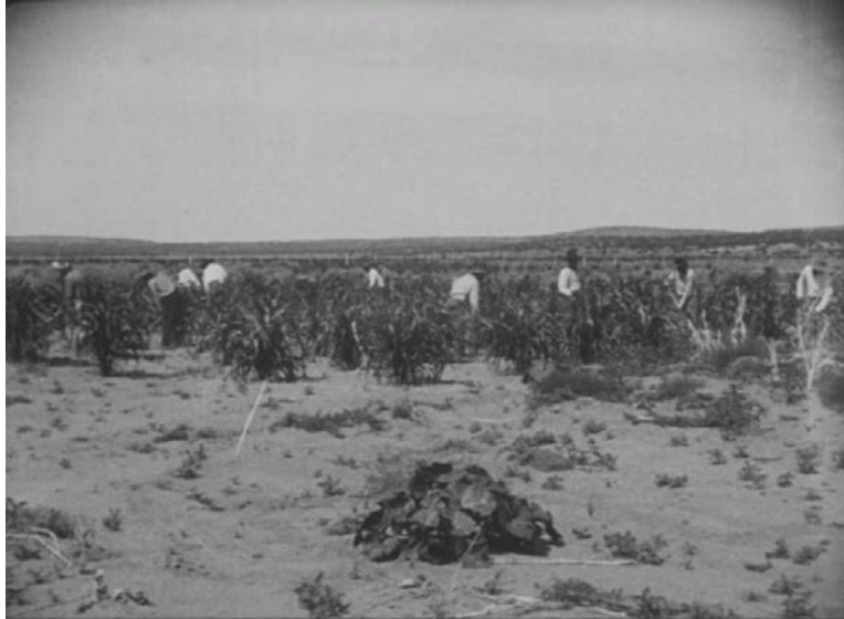
Figure 6. A group of community men working in the field. Land of the Zuni and Community Work film. Museum of the American Indian, Heye Foundation Zuni film series. National Museum of the American Indian, Smithsonian Institution.