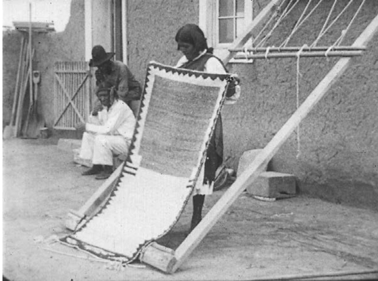
Figure 10. Zuni woman weaving a blanket. Weaving a Blanket film. Museum of the American Indian, Heye Foundation Zuni film series. National Museum of the American Indian, Smithsonian Institution.

In addition, these films provide excellent context for the other Zuni items in NMAI's collection, including thousands of objects, photographs, and manuscripts. For example, it shows the specific individual(s) weaving the blanket that we have in our object collection. Moreover, the films are of great interest to Zuni tribal members for cultural revitalization, especially of reinvigorating traditional knowledge and cultural practices that have been lost or forgotten.