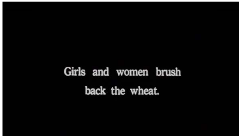
Figure 11. Girls and women brush back the wheat. Land of the Zuni and Community Work film. Museum of the American Indian, Heye Foundation Zuni film series. National Museum of the American Indian, Smithsonian Institution.