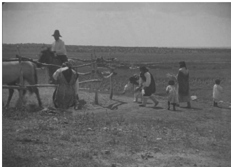
Figure 12. The women are shown brushing back the wheat, but they are not specifically identified by name in the inter-titles. Land of the Zuni and Community Work film. Museum of the American Indian, Heye Foundation Zuni film series. National Museum of the American Indian, Smithsonian Institution.