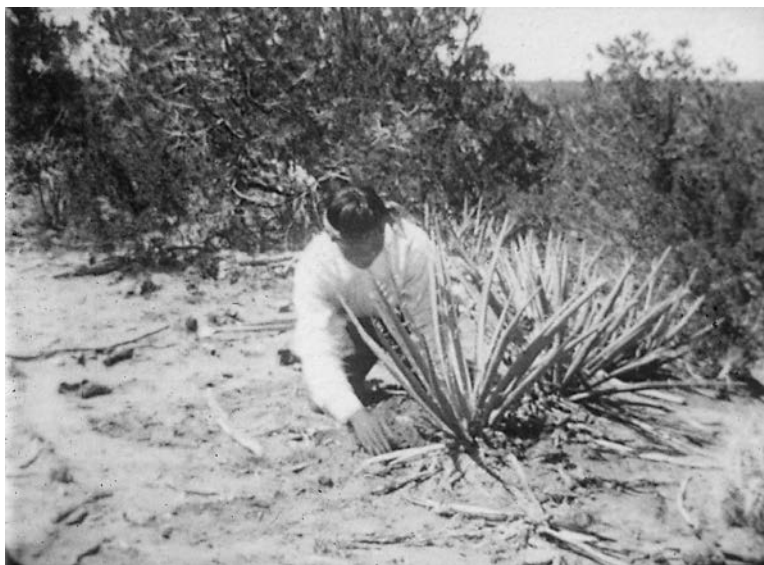
Figure 9. Zuni man collecting water from a yucca plant. Hair Washing film. Museum of the American Indian, Heye Foundation Zuni film series. National Museum of the American Indian, Smithsonian Institution.

The five other non-ceremonial films in the series also contain demonstrations of traditional crafts including pottery-making and leather tanning, as well as sustenance practices such as harvesting wheat and building ovens, and commonplace daily activities such as hair washing and bread baking (Figures 9-10).