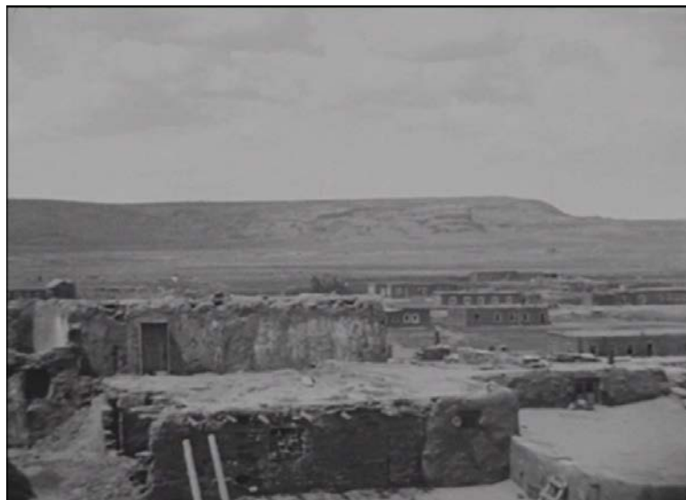
Figure 5. Landscape shots of Zuni. Land of the Zuni and Community Work film. Museum of the American Indian, Heye Foundation Zuni film series. National Museum of the American Indian, Smithsonian Institution.