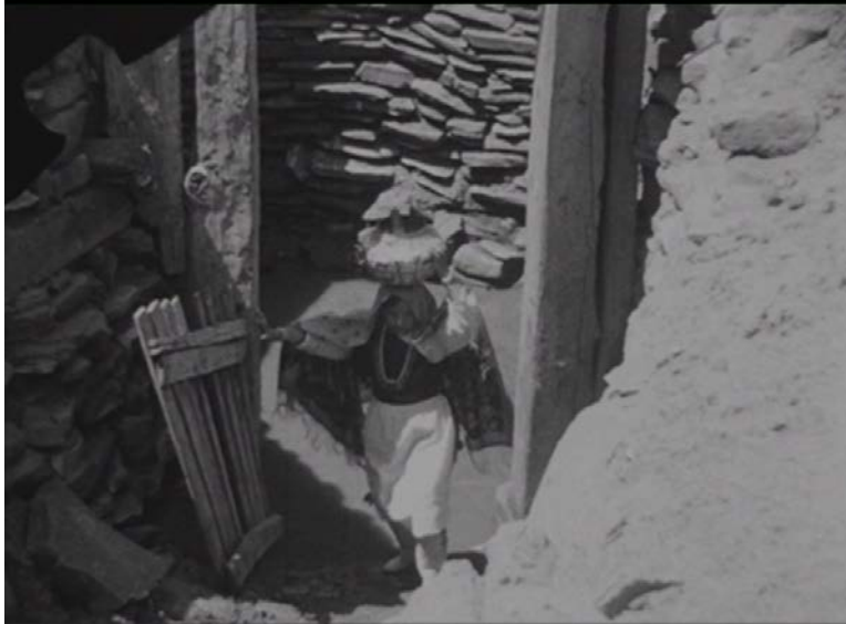
Figure 8. Woman gathering water at the ancient well in Zuni. Land of the Zuni and Community Work film. Museum of the American Indian, Heye Foundation Zuni film series. National Museum of the American Indian, Smithsonian Institution.

The five other non-ceremonial films in the series also contain demonstrations of traditional crafts including pottery-making and leather tanning, as well as sustenance practices such as harvesting wheat and building ovens, and commonplace daily activities such as hair washing and bread baking (Figures 9-10).