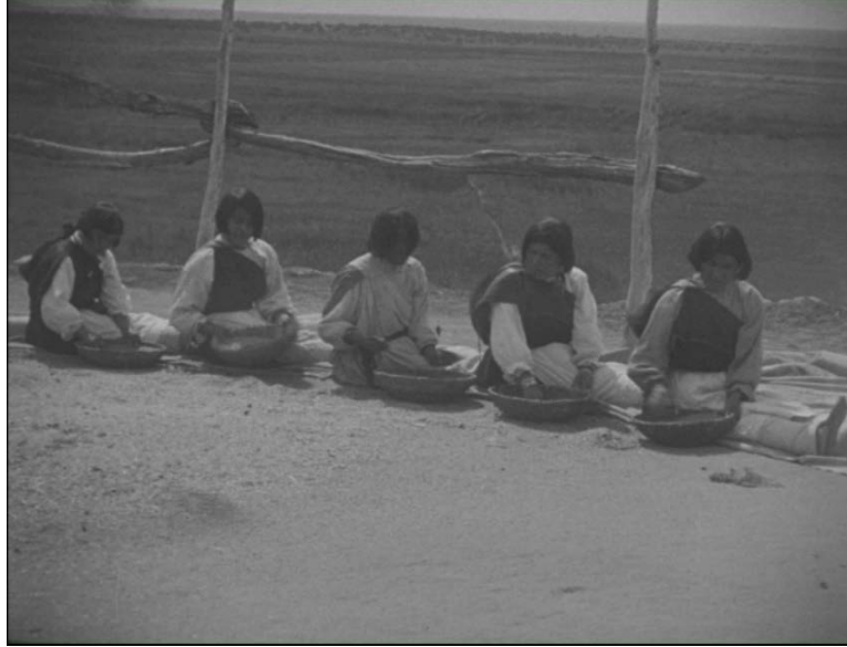
Figure 13. The women are shown doing the final winnowing of the wheat with open mesh baskets, but they are not specifically identified by name in the inter-titles. Land of the Zuni and Community Work film. Museum of the American Indian, Heye Foundation Zuni film series. National Museum of the American Indian, Smithsonian Institution.

To date NMAI has received back the fully preserved and digitized versions of all the Zuni films. NMAI will now begin work with the A:shwi A:wan Museum and Heritage Center, and selected tribal community elders and scholars, to gather tribal knowledge about the subject matter addressed in the films. Once that information is received, NMAI will use digital derivatives of the preserved films to create new versions with culturally-corrected inter-titles and enhanced catalog records that will further enhance the research value of these films. We will work together with the A:shwi A:wan Museum and Heritage Center to determine a means of sharing the results of this collaboration. For instance, both versions of the film may be uploaded to the NMAI website for dissemination, along with a detailed catalog record that includes a full description of the project and the reason for the two versions which will provide context about the original version and the new version with the updated inter-titles. This will provide an opportunity to include much needed context about the film, as well as the inaccuracies in the original film's inter-titles. 12