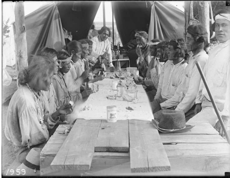
Figure 3. Zuni workmen eating dinner at Camp Harmon. August 10, 1917. Photograph by Frederick Webb Hodge. National Museum of the American Indian, Smithsonian Institution (N01959).

Although Hodge and other anthropologists heavily documented the larger expedition at Hawikku, unfortunately very little evidence exists regarding the creation of the Zuni film series. Below is the only detailed account of the creation and later use of the films created at Zuni, as noted in the MAI publication, Indian Notes , in 1924: