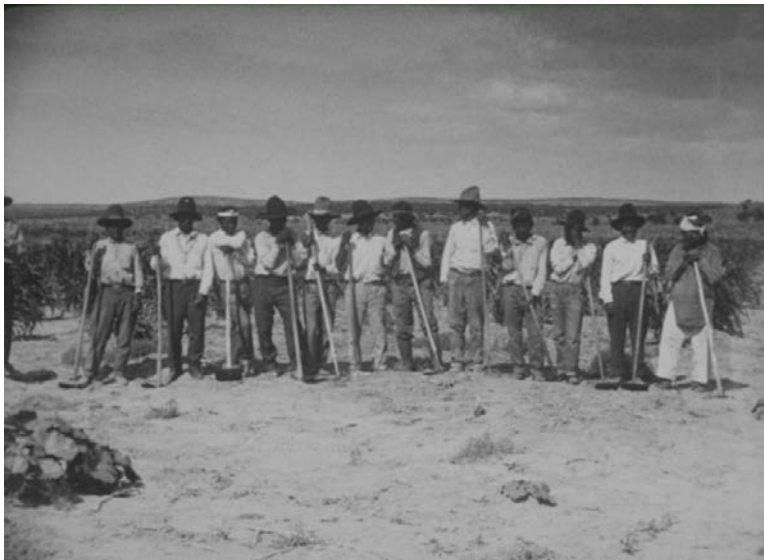
Figure 7. Community men gathered to work in the field. Land of the Zuni and Community Work film. Museum of the American Indian, Heye Foundation Zuni film series. National Museum of the American Indian, Smithsonian Institution.