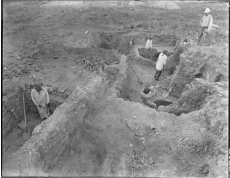
Figure 2. Zuni workmen excavating Hawikku in 1921; Gaialito is standing in room 339 (left, foreground) and Frederick Webb Hodge is in the background. The view is looking southeast onto the eastern tier of rooms with number 350 in the foreground. Photograph attributed to Frederick Webb Hodge. National Museum of the American Indian, Smithsonian Institution (N07472.)

In addition, at least 39 Zuni men participated in the excavation work of their ancestral villages. Hodge noted that he considered these men his “friends” who “would have granted any favor” (Smith, Woodbury, and Woodbury 1966:3) (Figures 2-3). He held a specific Zuni medicine man in very high regard, as Hodge acknowledged that he could not have understood many of the items without his knowledge. Indeed, the work at Hawikku could not have been completed without the detailed assistance of the Zuni men who had traditional knowledge and insight regarding the region and site. Furthermore, Hodge generally appreciated and thanked the community for their assistance and efforts during the excavation. For example, at the end of the final season in 1923 Hodge held an open house for the neighborhood where he fed over 80 wagonloads of community members and ended the celebration with fireworks. At the time, the Hendricks-Hodge Expedition was the most extensive archaeological investigation of the Southwest (see Smith, Woodbury, and Woodbury 1966; Hodge 1937). 7 Although Hodge followed proper protocols regarding research and relations among the tribal community, it is imperative that these protocols are re-thought and re-negotiated, particularly with new circumstances regarding the dissemination of the information through the internet.