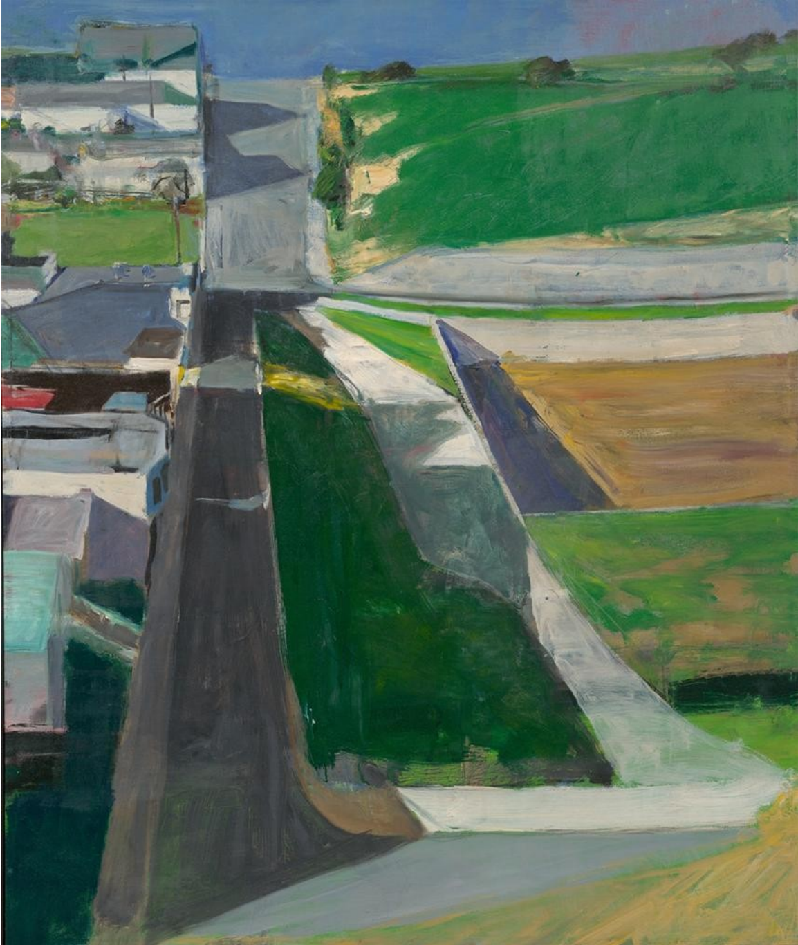
Figure 2. Richard Diebenkorn, Cityscape I (formerly Landscape I ), 1963 (oil on canvas, 60 ¼ x 50 ½ inches) 21