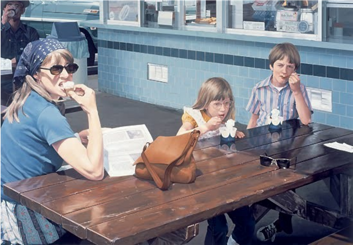
Figure 17. Robert Bechtle, Fosters Freeze, Escalon , 1975 (oil on canvas, 40 x 58 inches) 81

2005 SFMOMA Retrospective, Jonathan Weinberg notes, “A photograph may be flat, but we don’t necessarily see it that way. We oscillate between a sense of two-dimensionality and depth. Looking intensely at a photograph (or a painting for that matter) is not a static process, even when the picture itself is static.” 82 Weinberg references the idea that Bechtle’s work can be seen as a representation of a two-dimensional object (the photograph), but also as a three-dimensional scene because of the familiar content of the photograph. Indeed, this hypothesis aligns with the artist’s aims as outlined in his 1973