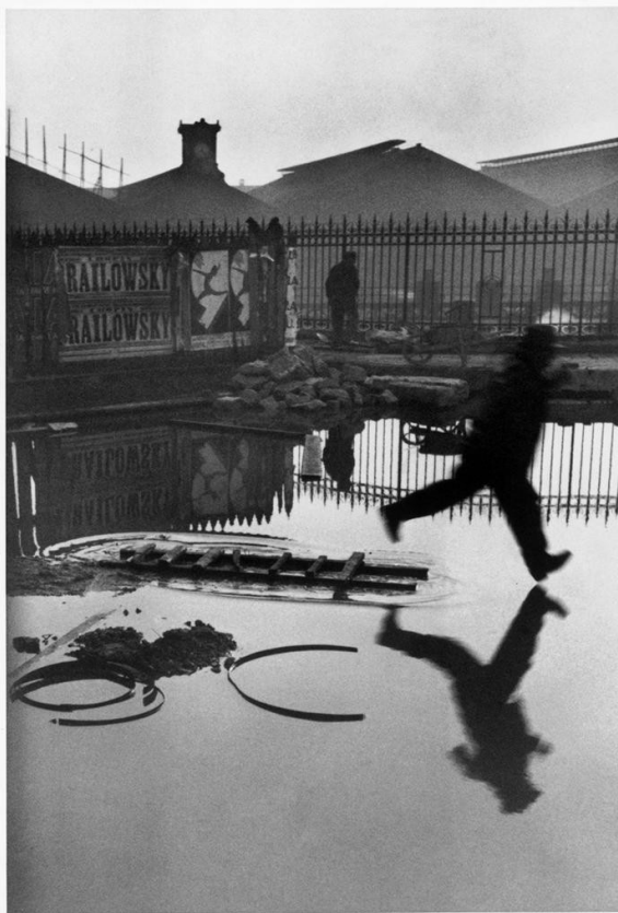
Figure 13. Henri Cartier-Bresson, Derriere la Gare Saint-Lazare ( Behind the Gare Saint-Lazare, Paris ), 1932 (photograph) 58

adopted by art photography in the late nineteenth and early twentieth centuries under the rubric of Pictorialism.” 56 Photography began cementing its foundations in the artistic tradition through the “heroic” works of Art Photography—works like those of Ansel Adams and Henri Cartier-Bresson, for instance, which were thought to be “taken by great geniuses.” 57 Cartier-Bresson’s Derriere la Gare Saint-Lazare [Fig. 13] demonstrated that photography could capture a “decisive moment”—the unparalleled achievement of the camera as a device that could arrest or “freeze” a moment in time.