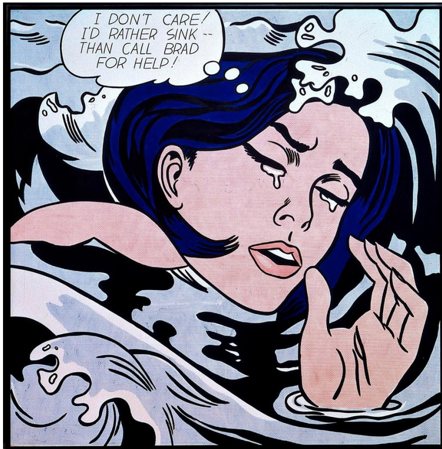
Figure 6. Roy Lichtenstein, Drowning Girl , 1963 (oil on canvas, 68 x 68 inches) 39

Polaroid camera and automobile (which frequently appear in Bechtle's compositions) were easily accessible to this growing consumer market. 38