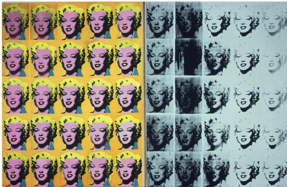
Figure 8. Andy Warhol, Marilyn Monroe Diptych , 1962 (silkscreen on canvas, 82 x 57 inches) 42