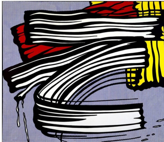
Figure 7. Roy Lichtenstein, Little Big Painting , 1965 (oil on canvas, 68 x 80 inches) 41