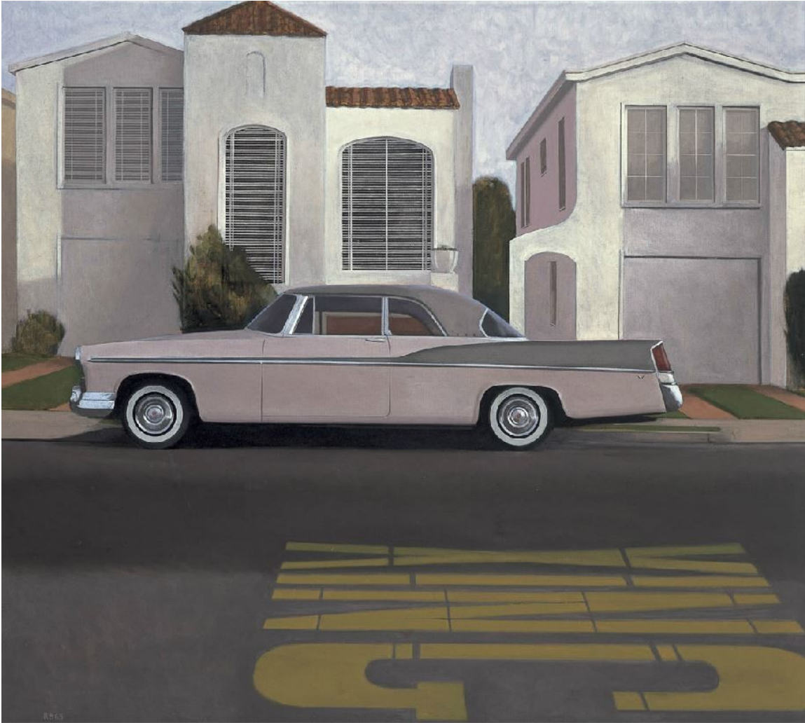
Figure 1. Robert Bechtle, '56 Chrysler , 1965 (oil on canvas, 36 x 40 inches) 14

at the California College of Arts and Crafts in Oakland to begin studying graphic design. After a brief stint in the Army, he returned for his MFA in painting, gaining exposure to the flourishing Bay Area Figurative movement. 15