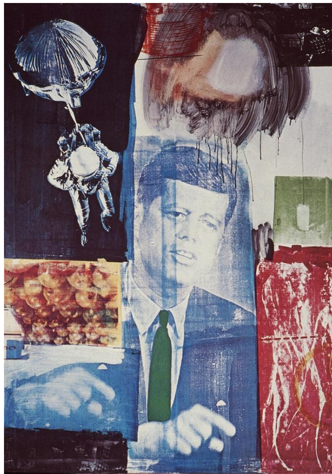
Figure 11. Robert Rauschenberg, Retroactive I , 1964 (silkscreen on canvas, 84 x 60 inches) 50

painting. Bechtle produces the illusion of three-dimensional reality through his hyperrealistic rendering of the content of the photograph. When considered in relation to Coke's commentary on Rauschenberg's work, Bechtle's work can also be thought of as playing with assumption that photographic images portray reality. Again, Bechtle's work functions on two levels, and while they appear to reproduce reality (the everyday snapshot), his paintings are ultimately abstracted images; they reproduce scenes through the two-dimensional photograph—not from real or three-dimensional objects.