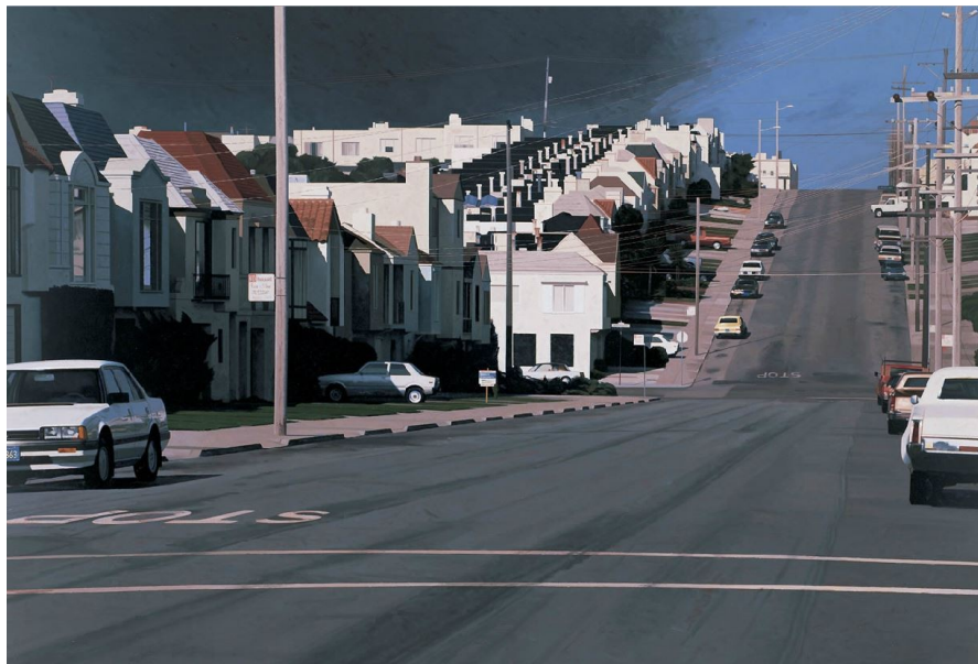
Figure 4. Robert Bechtle, Vicente Avenue Intersection , 1989 (oil on canvas, 48 x 69 inches) 31