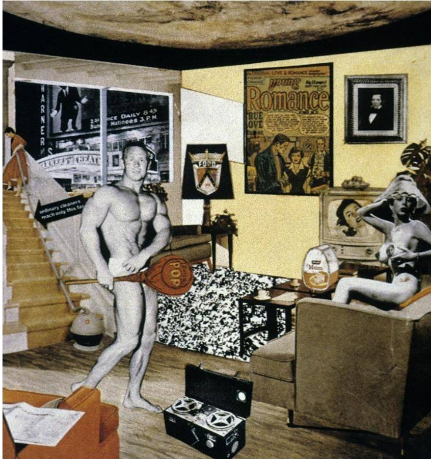
Figure 5. Richard Hamilton, Just What Is It That Makes Today's Home So Different, So Appealing? , 1956 (mixed media, 10 ½ x 9 ¾ inches) 36

lifestyle through a plethora of commercial references. The canned ham, television set, and vacuum cleaner all point to technologies and mass-produced products readily accessible to American consumers, yet unattainable in the scarcity of resources in Europe's postwar economic recovery. Hamilton would have been one of the artists whose work Bechtle saw in his travels overseas. 35