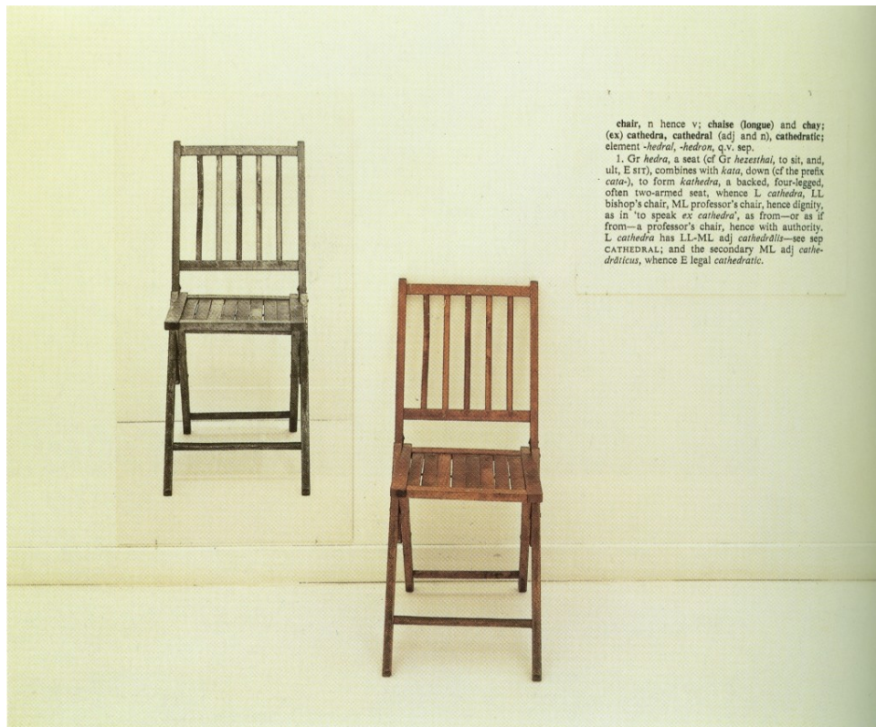
Figure 12. Joseph Kosuth, One and Three Chairs (installation view), 1965 (mixed media, variable dimensions) 55

installation suggests that mundane, everyday objects are equally suited to transmit ideas as traditional forms of art.