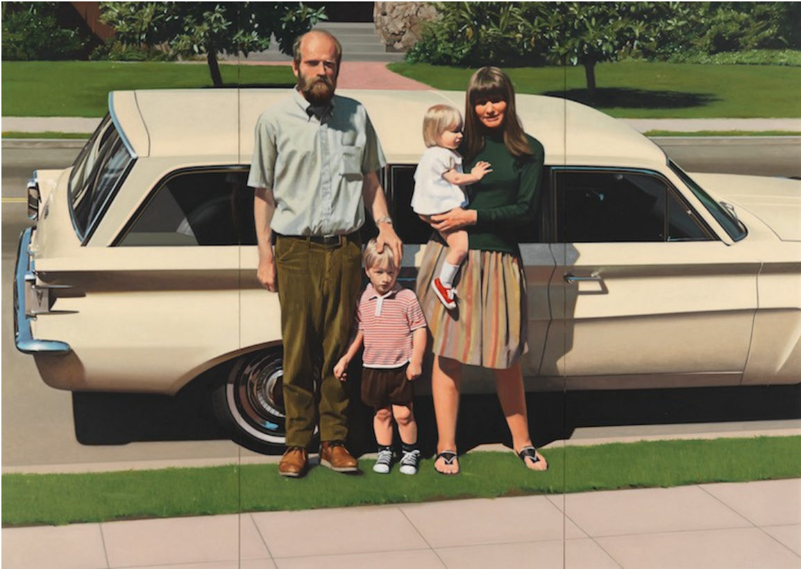
Figure 18. Robert Bechtle, '61 Pontiac , 1969 (oil on canvas, 60 x 84 inches) 86

created through the artist's hyperrealistic rendering. The emphasis ultimately remains on the overall work as a painting of a photograph.