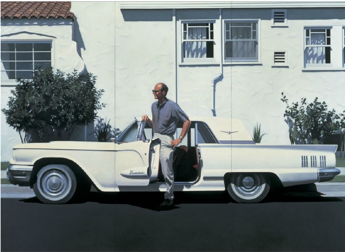
Figure 16. Robert Bechtle, '60 T-Bird, 1968-69, (oil on canvas, 72 x 98 7/8 inches) 80

Realist painting from becoming obsolete. While the inclusion of the artist's own pair of sunglasses in Fosters Freeze, Escalon [Fig. 17] appears incidental, Bechtle jokes that they evoke his presence in the image, as though reminding the viewer that the painter—not the camera—is responsible for the artwork on display. 79