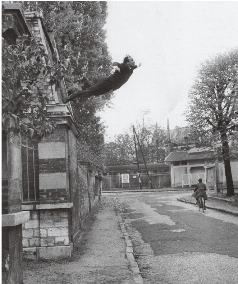
Figure 14. Yves Klein, Dimanche (Leap into the Void) , 1960 (photograph) 70

because of the degree of literal visual translation of the photographic image. 69 Yet consideration of Photorealism in relation to the Conceptual movement and the preoccupation with photography provokes a greater level of inquiry than the typical surface reading of Photorealistic paintings, as this discussion brings an additional question to the foreground: Why was the snapshot photograph of particular interest to Bechtle?