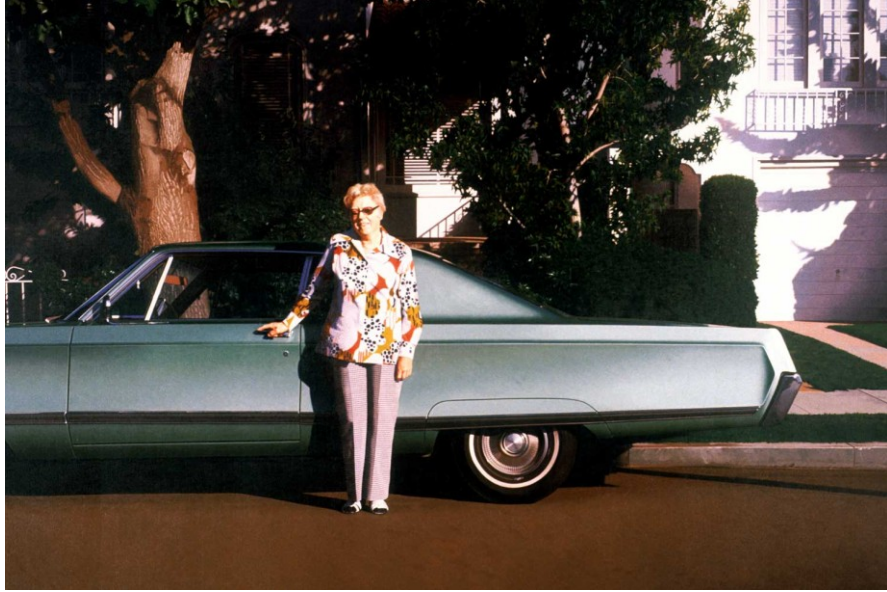
Figure 3. Robert Bechtle, Alameda Chrysler , 1981 (oil on canvas, 49 x 70 inches) 30