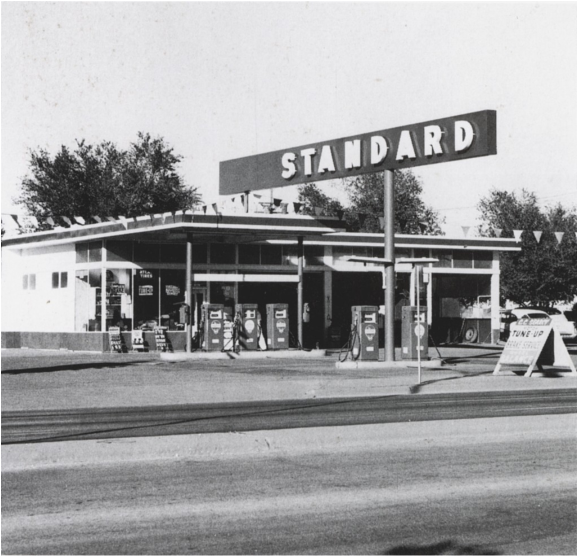
Figure 15. Edward Ruscha, Standard Station, Amarillo, Texas (from Twentysix Gasoline Stations ), 1963 (photograph) 73

photograph; the next two chapters will expand upon this context to discuss the manner in which Bechtle's approach to the photograph blurs the aforementioned distinctions.