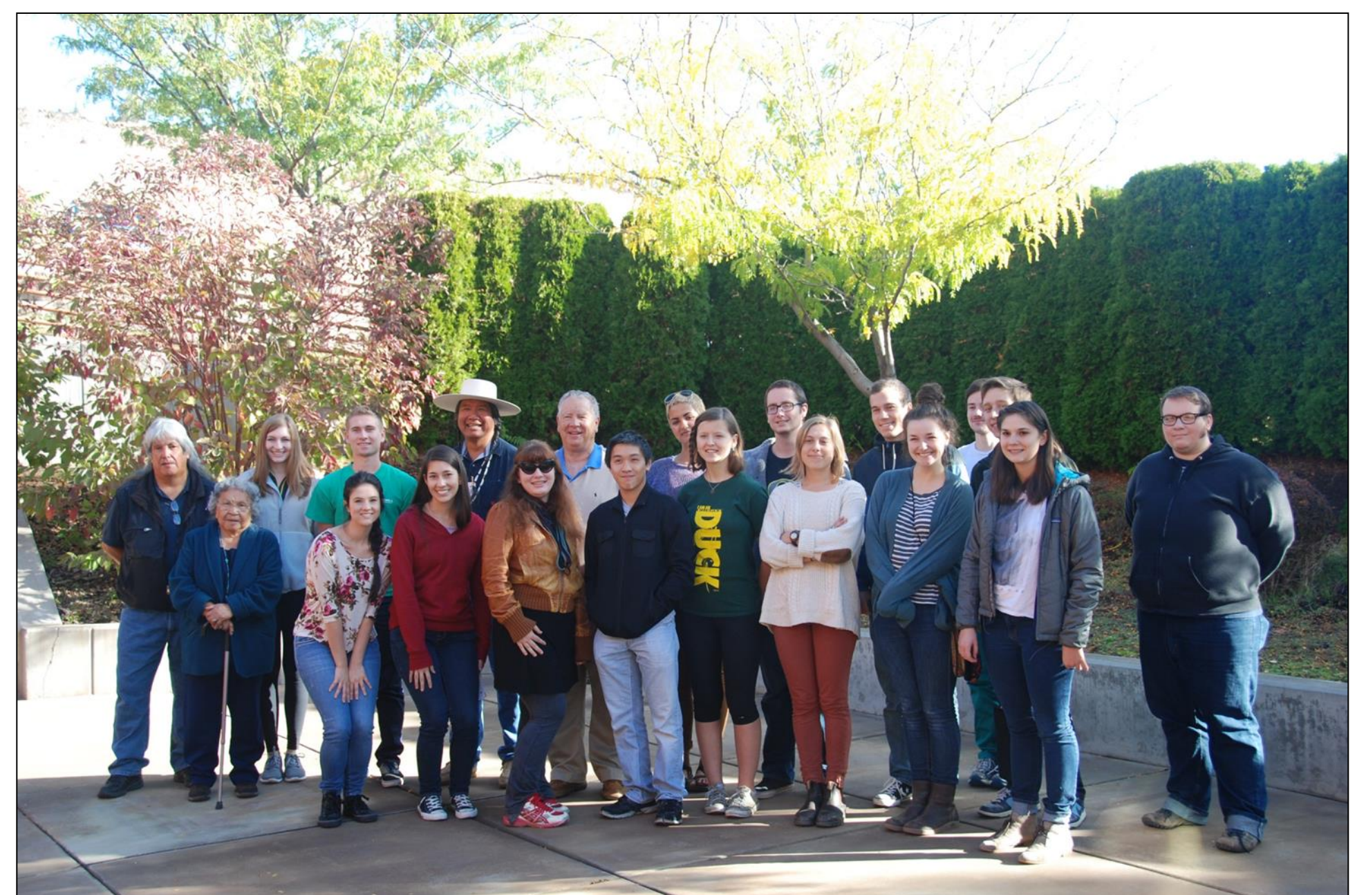
Figure 4. Students with the tribal elders and visiting scholar at Kah-Nee-Ta, Warm Springs Reservation, 2014.