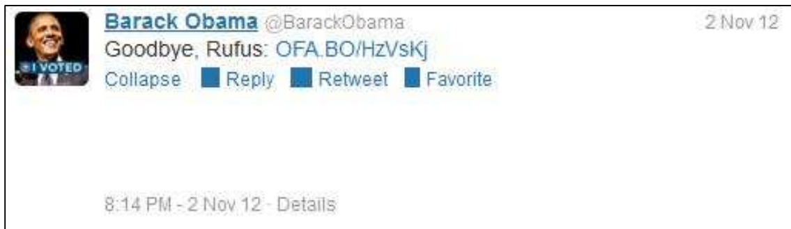
Figure 1. Tweet of undetermined topic. From Twitter.com/barackobama by B.Obama, 2012. Retrieved November 2, 2012 from https://Twitter.com/barackobama

The category of "other" topics as noted by the coders included education and leadership. A handful of posts contained no topic that could be identified, such as a tweet from Obama on November 2 (Obama, 2012), as shown in Figure 1.