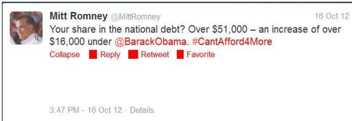
Figure 2. Attack function example. From Twitter.com/mittromney by M.Romney, 2012. Retrieved October 16, 2012 from https://Twitter.com/mittromney

Within Romney's tweets, 40.8% contained an attack message. On Facebook, 18.8% of his posts included attack content. Attacks on Twitter reflected the reactive posts related to the three debate dates in the study, such as this attack tweet on October 16, the night of the second presidential debate (Romney, 2012) as shown in Figure 2.