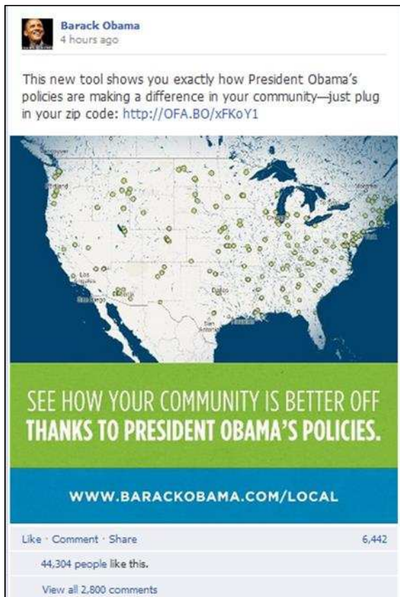
Figure 3. Acclaim function example. From facebook.com/barackobama by B.Obama, 2012. Retrieved November 8, 2012 from https://facebook.com/barackobama

message. An Obama Facebook post from October 8, 2012, the same date as Romney’s major foreign policy address, contained an acclaim which included an interactive call to action (Obama, 2012), as shown in Figure 3.