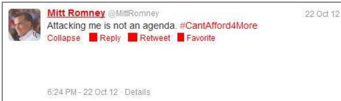
Figure 4. Defense function example. From Twitter.com/mittromney by M.Romney, 2012. Retrieved October 22, 2012 from https://Twitter.com/mittromney

Romney's second brief defense post occurred on Twitter and appeared on October 22, 2012, following the final presidential debate (Romney, 2012), as seen in Figure 4.