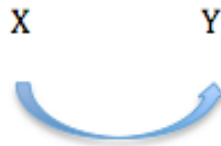
Figure 1: X modifies Y

Ex. 1.1. 张三 昨天 吃 饭 (John-Subj.) (yesterday-time) (ate-V) (rice-NP) John ate rice yesterday