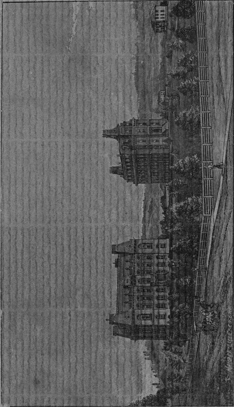
UNIVERSITY OF OREGON, EUGENE.