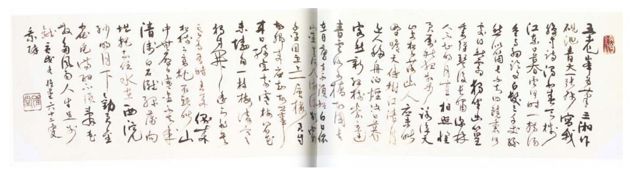
Figure 6. Selection of Classical Poems, 26x 96cm, 1970. Gyeongnan Art Museum.