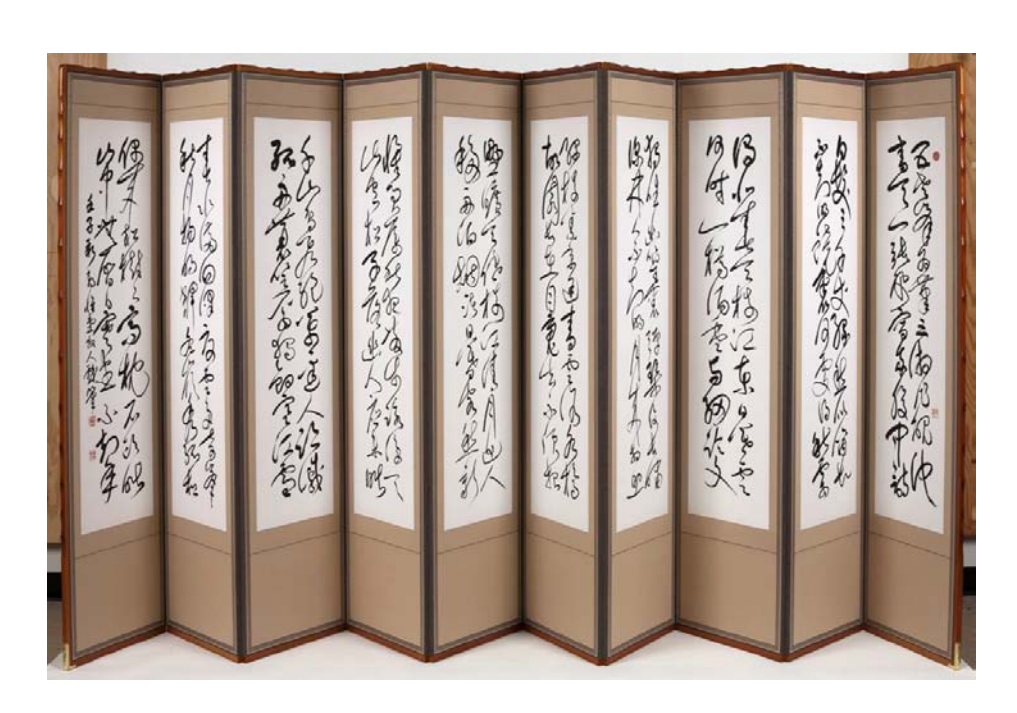
Figure 1. Jung Hyun-bok, Using the Peak of the Five Elders as a Brush .130x33cm x10, 1972. Jordan Schnitzer Museum of Art.