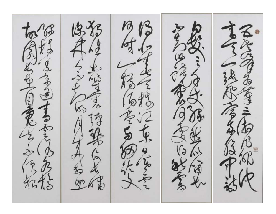
Figure 3. Jung Hyun-bok, Individual panels from Using the Peak of the Five Elders as a Brush. (Right to Left: panel 1, 2, 3, 4, 5) Jordan Schnitzer Museum of Art.