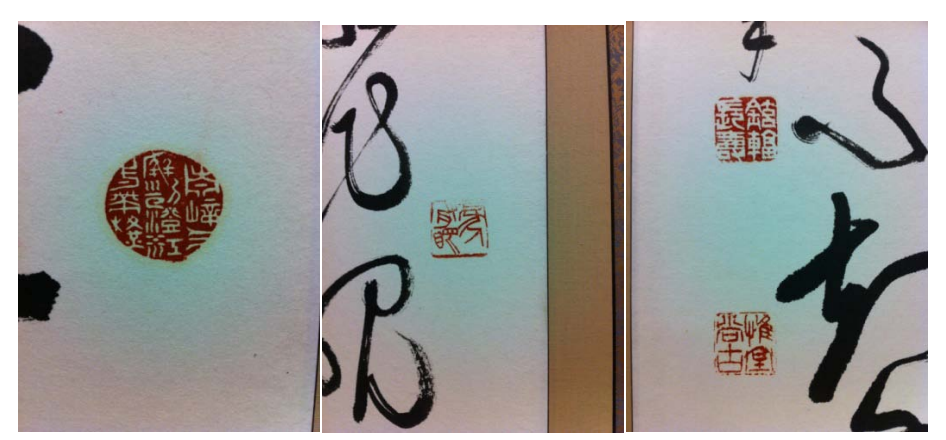
Figure 2. Seals on Using the Peak of the Five Elders as a Brush . (from left to right: "青嶂三屏列, 澄江一帶橫 (Green Mountains stand like screens, Clear river spreads like a broad strip)"; "旁人有眼(bystanders have eyes)"; "鉉輻長壽(long life for Hyun-bok)", "惟堂尚古 (Yudang admires tradition)")