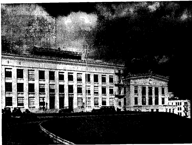
Below: Medical School Building.